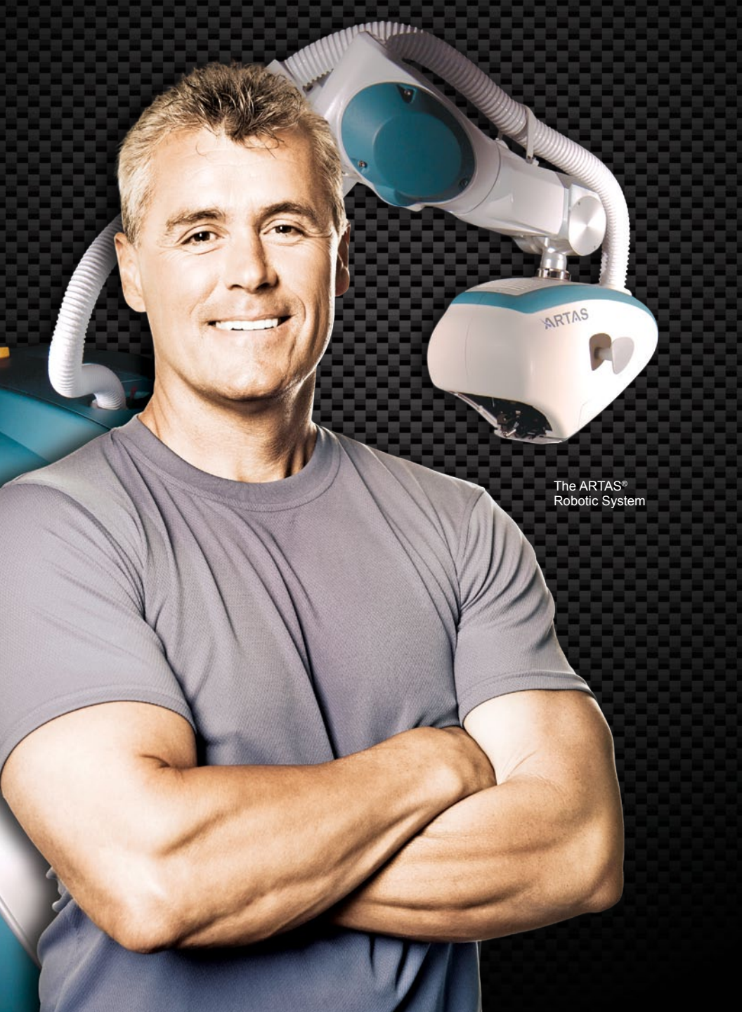
The ARTAS® Robotic System