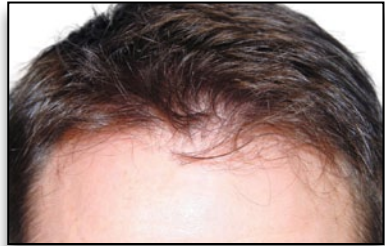
Hairline 9 months later