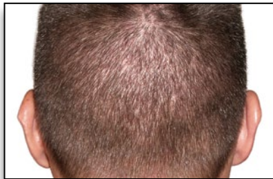
Donor area - 1 week later