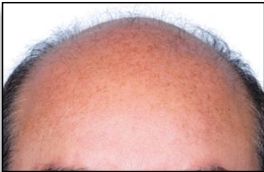
Hairline before the procedure