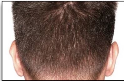
Donor area - Before procedure