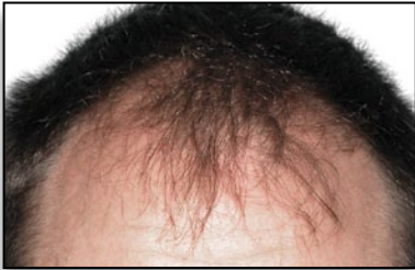
Hairline before the procedure

Hair growth typically begins around the 3 rd and 4 th month after your procedure. The majority of hair growth usually occurs between 5 and 8 months following your procedure, with the remainder of growth between 8 and 12 months. This is a guideline regarding hair growth following your procedure. There are some patients who experience all of their growth early and some patients experience growth up to 1 year or more post-procedurally.