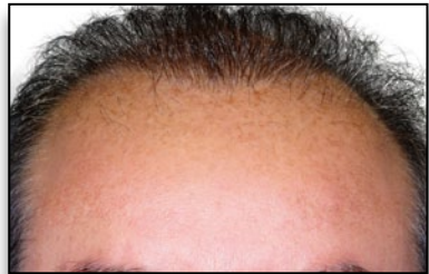
Hairline 12 months later

Precision robotics and your physician's expertise deliver safe, consistent, natural-looking results you can enjoy for a lifetime.