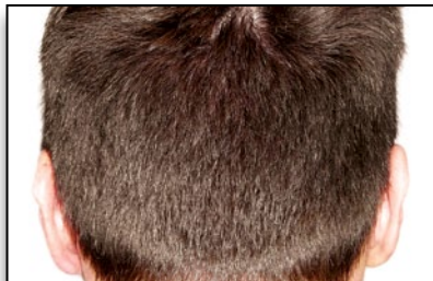
Donor area - 9 months later